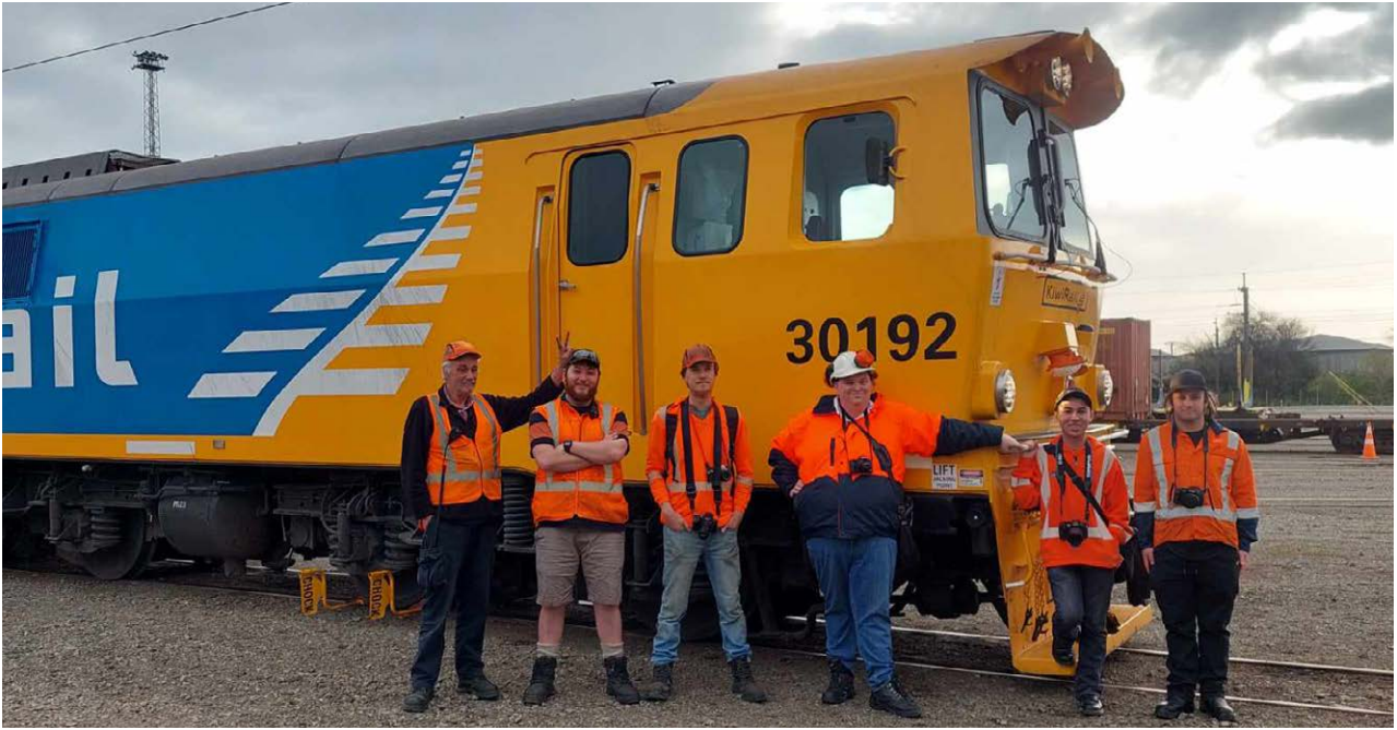
Participants of the first 'NextGen' session at Palmerston North.