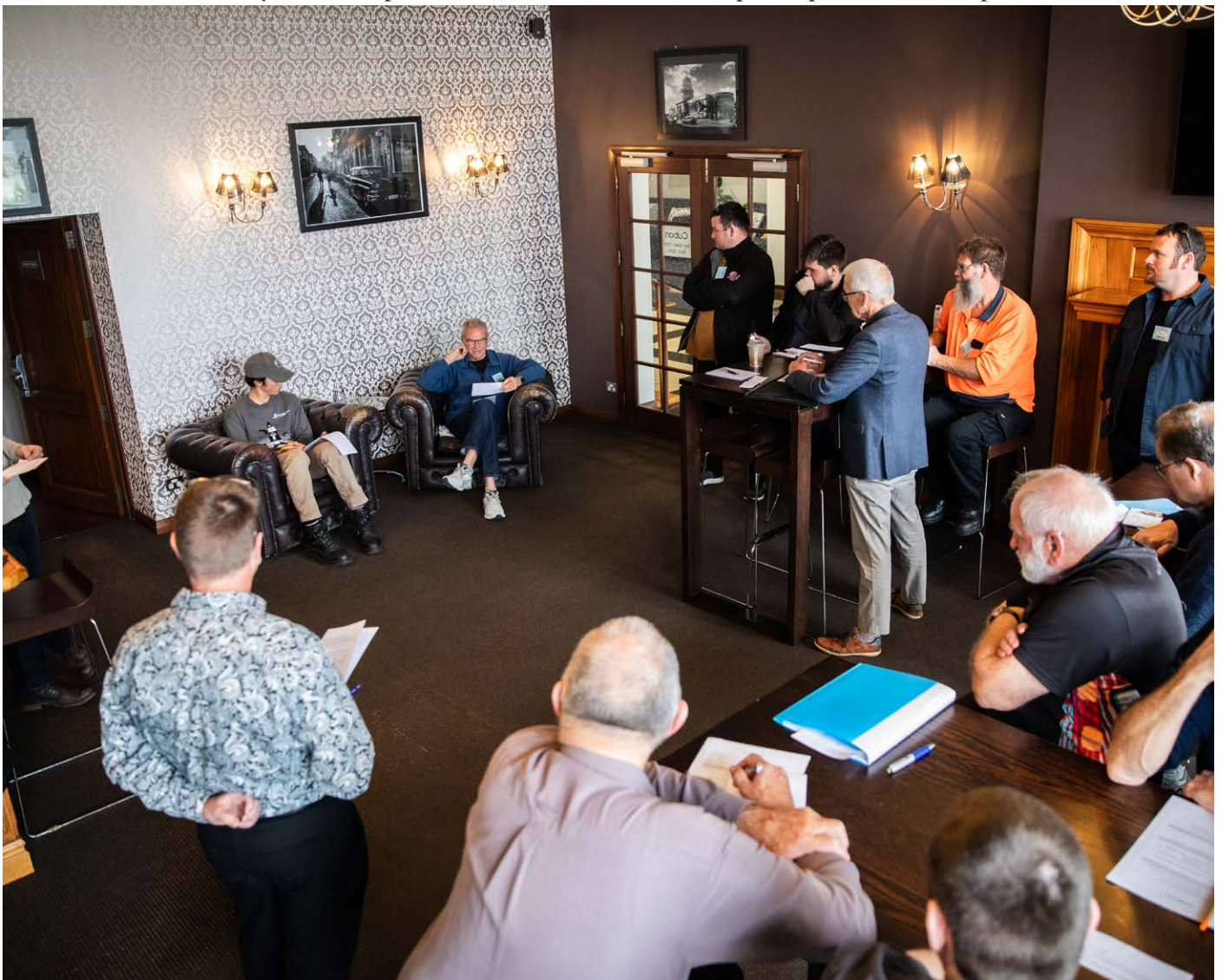
NZTA's 'safety moment' presentation involved audience participation and had positive reviews ↓

This shows how your feedback can benefit everyone!